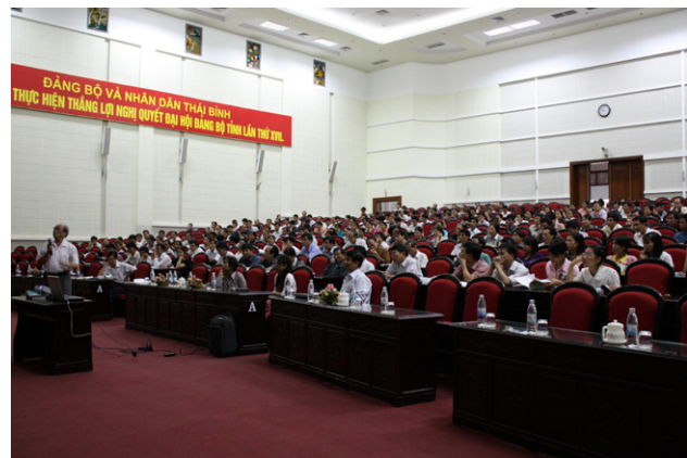
Promoting the ABC Program at the inaugural lecture on April 23, 2008 in Hanoi, Vietnam.

In 2008, the start of the World Stroke Organization (WSO) ABC Education Program Stroke Management in Vietnam was reported in the International Journal of Stroke (1). Now, the successful ending of this program is reported. Until the end of 2011, the trainings took place in 58 cities and provinces with 8596 doctors participating. The attending doctors received a certificate signed by the WSO and the Ministry of Health in Hanoi, Vietnam. In 2008, there was virtually no structured stroke care existing in Vietnam. Today, stroke is recognized as a separate disease by most doctors. Vietnam has now a National Stroke Society that holds annual meetings and a Vietnamese edition of the International Journal of Stroke . A program endorsing the setting up of stroke units has been endorsed by the government and the stroke society.